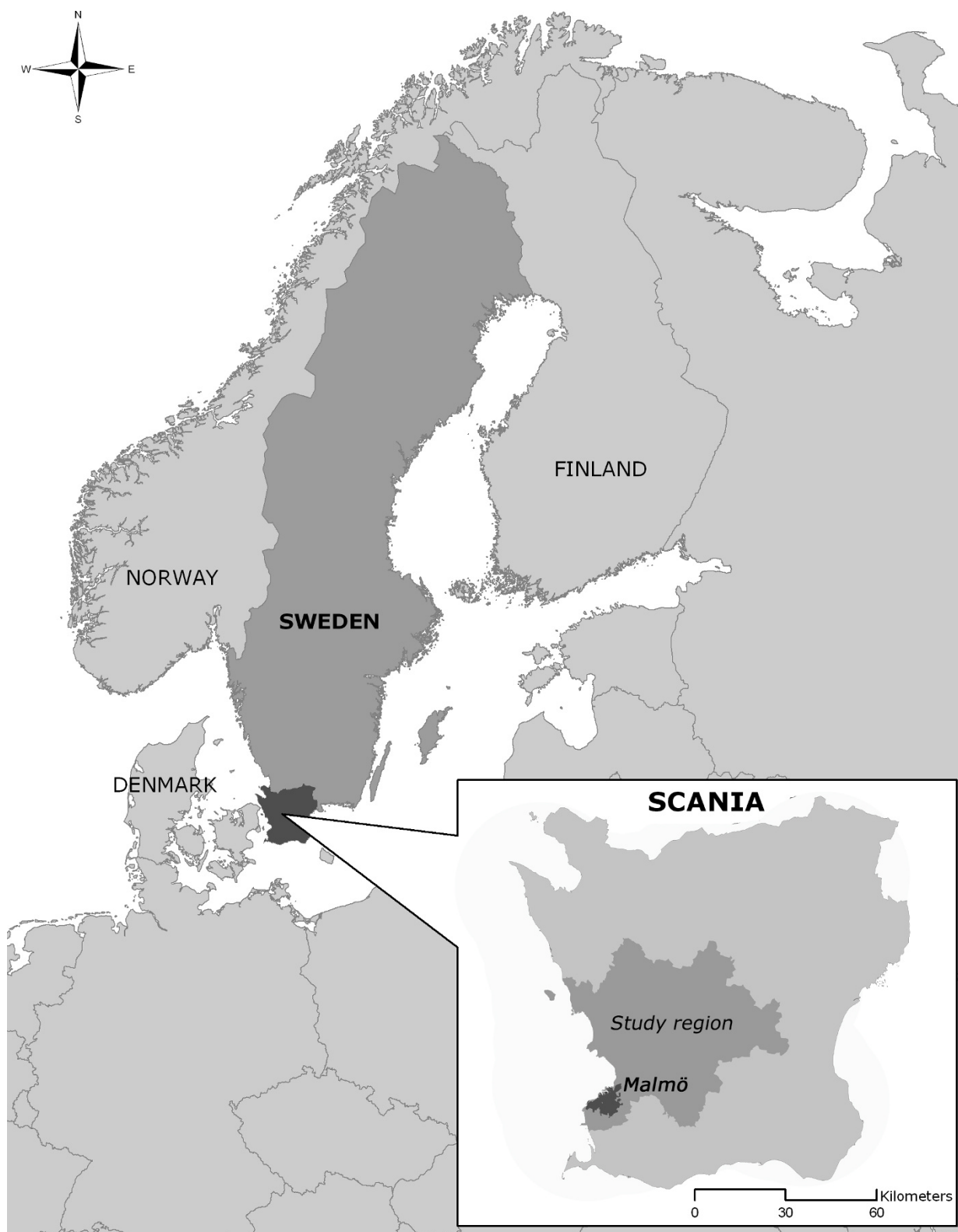
Figure 1 Study area. Malmö is the largest city in the study region, which comprises the southwestern part of Sweden.