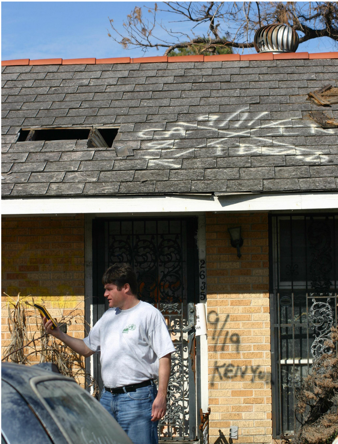
Figure 1 Hurricane Katrina search and rescue marking. This house displays the typical search and rescue "X". A California task force visited the house on September 11 th and they found "I dead". "Kenyon" removed the body on September 19 th . The field team member is seen in front of the house marking its location with a GPS.